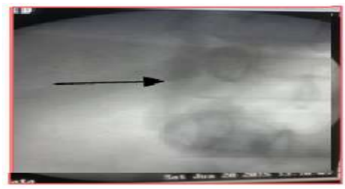
Fig2. Contrast flows upwards along the Inferior vena cava shown by arrow.

On aspiration, fresh blood came out through the catheter. So we suspected some retroperitoneal great vessel injury. Fluoroscopy was done. The catheter tip was seen to have crossed the vertebral column. With contrast, it seemed to have coiled inside the Inferior vena cava. No extra-vasation of contrast noted. The patient was hemodynamically stable with mild tachycardia. Though no extra-vasation of contrast was seen on fluoroscopy, we suspected some vascular injury. So, exploratory laparotomy was planned.