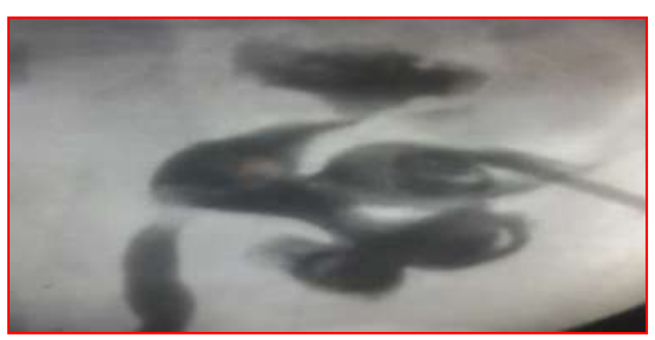
Fig 4. Finally We Put The Catheter Inside The Middle Calyx.

After taking proper vascular control, we pulled the catheter from outside under fluoroscopic guidance until it coiled inside the middle calyx. There was no bleeding at the hilum after the procedure. We fixed the catheter to act as a nephrostomy tube.